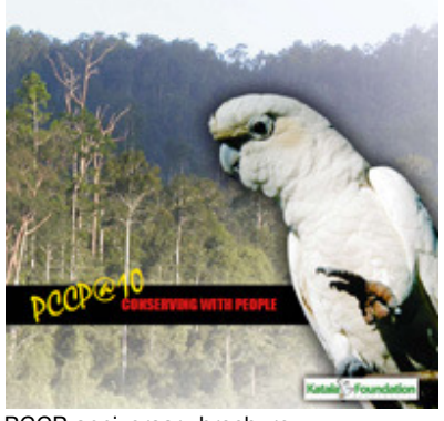
PCCP anniversary brochure

The PCCP is the main program implemented by the Katala Foundation Inc. (KFI). Senator Juan Miguel Zubiri, KFI President will lead the recognition and honors deserved by our Tagbanua, Pala'wan and Cuyunin wildlife wardens from three project sites in the province. Among the local partners we will confer recognition are the Municipalities of