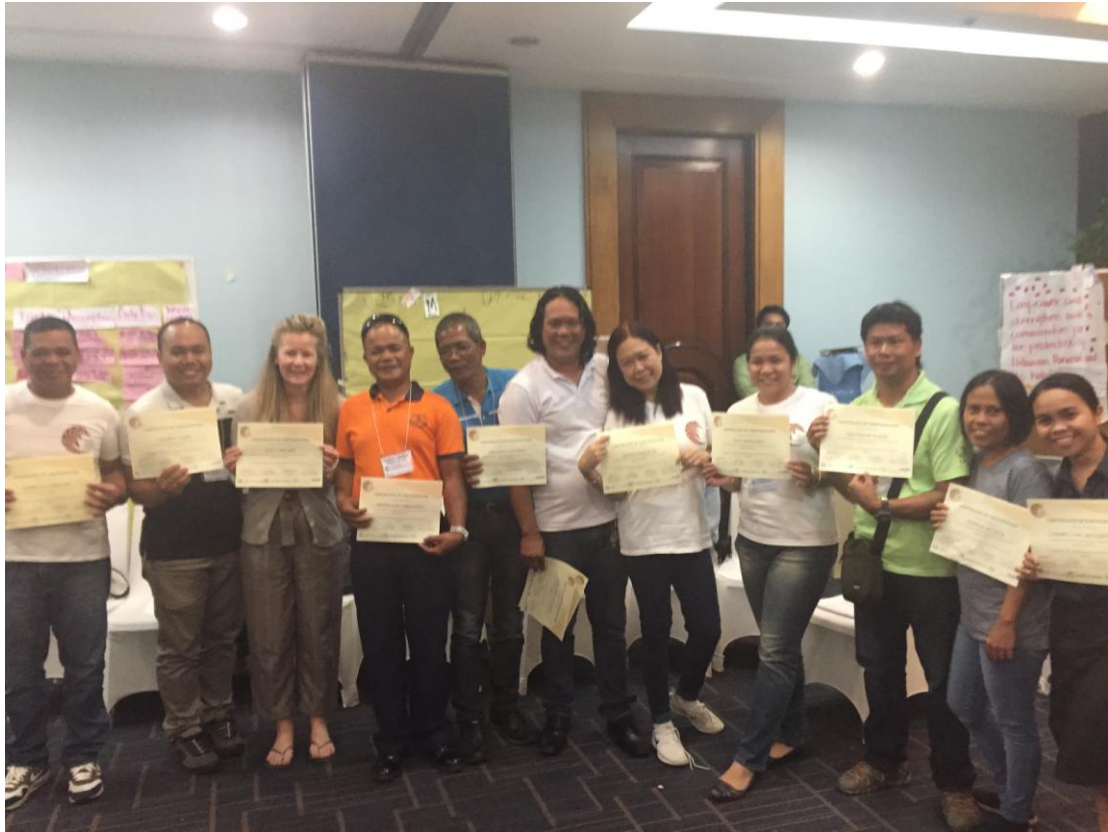
Celebrating the end of the workshop.