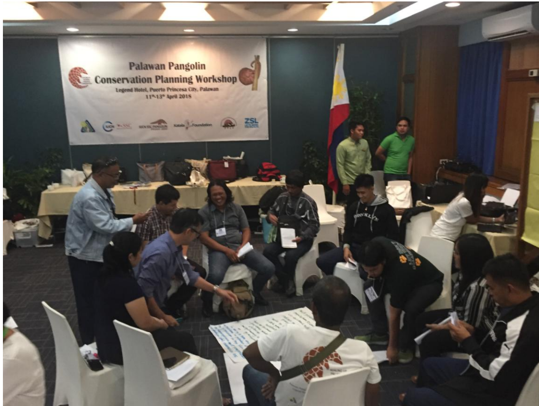
Groups of participants joined to collectively form a vision statement for the Palawan pangolin over the next 25 years.

The principal issues negatively affecting the Palawan pangolin, as identified by participants, included illegal trade, lack of knowledge of the species and its ecology and biology, habitat loss, and circumstances surrounding Indigenous Peoples and their access to natural resources. Following a process of issues analysis and objective prioritization, a suite of key actions were agreed and will be outlined in the final strategy. They include improved law enforcement to prevent poaching and trafficking of pangolins, empowering indigenous peoples and local communities to increase stewardship and protection efforts, and the prevention of habitat loss and degradation caused by poor land use planning. An additional key objective comprised increasing research efforts in order to increase knowledge of this species and its conservation needs.