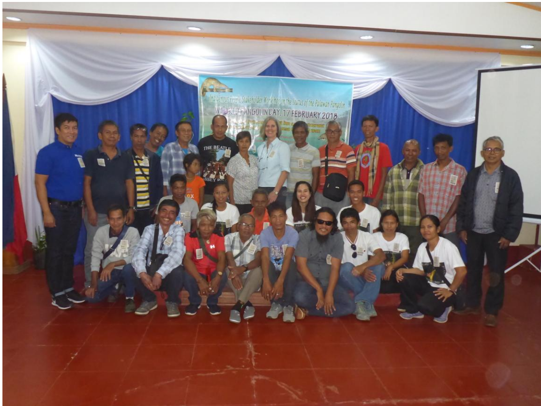
Group picture from the Stakeholder Workshop held on World Pangolin Day.

highlighted the valuable information that they can contribute to narrow the knowledge gap on pangolins, including their distribution, population levels, threats, and traditional uses and values.