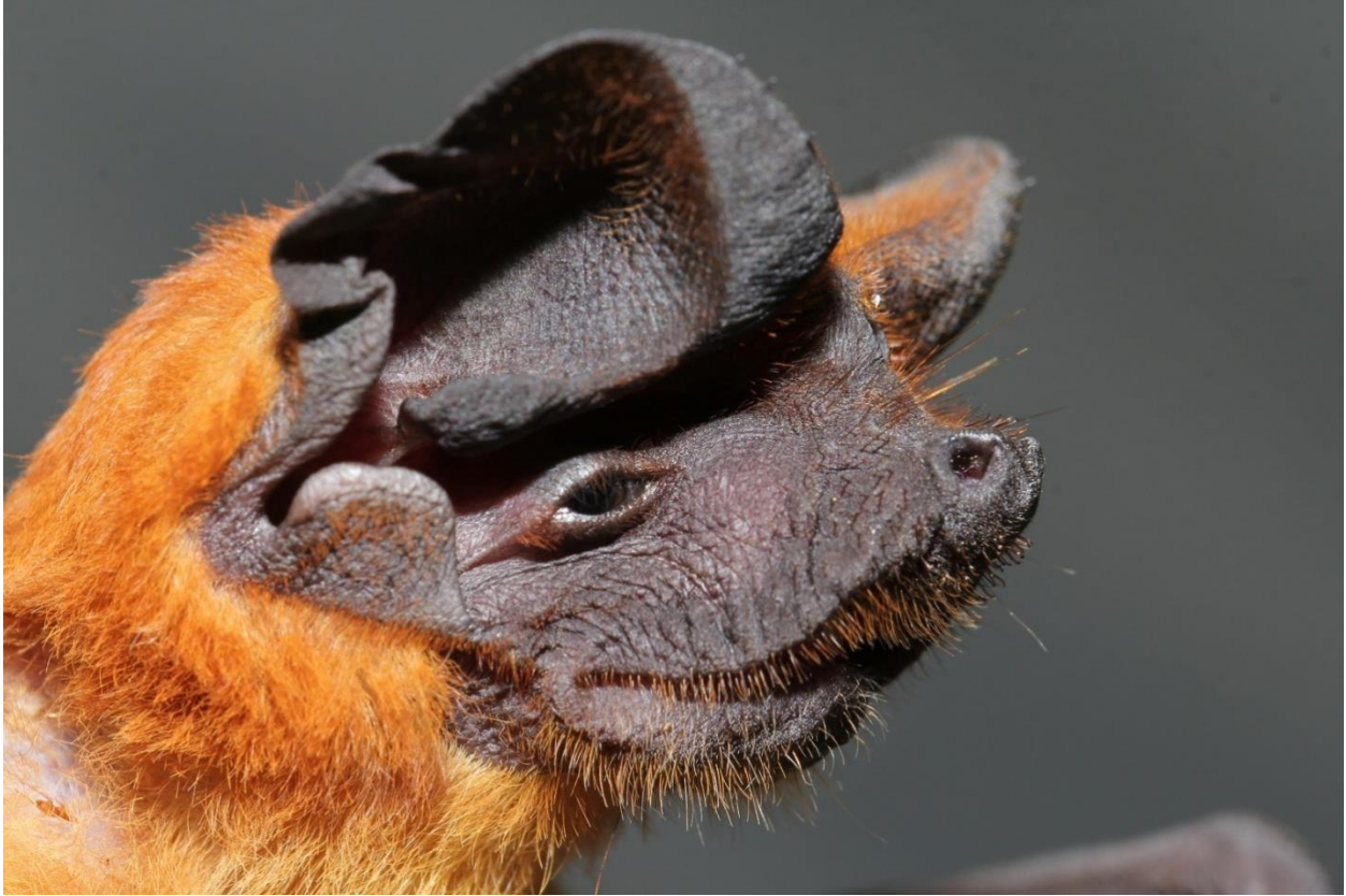
Free-tailed bats are very rarely caught in surveys and therefore are poorly known in Palawan; only two species are recorded from the island and two species were netted during the survey in IPPF