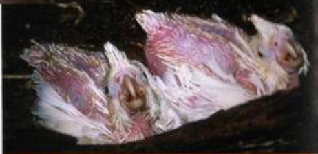
Clutch of wild Philippine Cockatoos

P alawan is a long and narrow island in the western part of the Philippines, quite close to Borneo. It is a hotspot for biological diversity and also for naturalists, particularly birdwatchers and SCUBA divers. The forest cover is still good and there are abundant coral reefs, seagrass beds and mangroves to be explored.