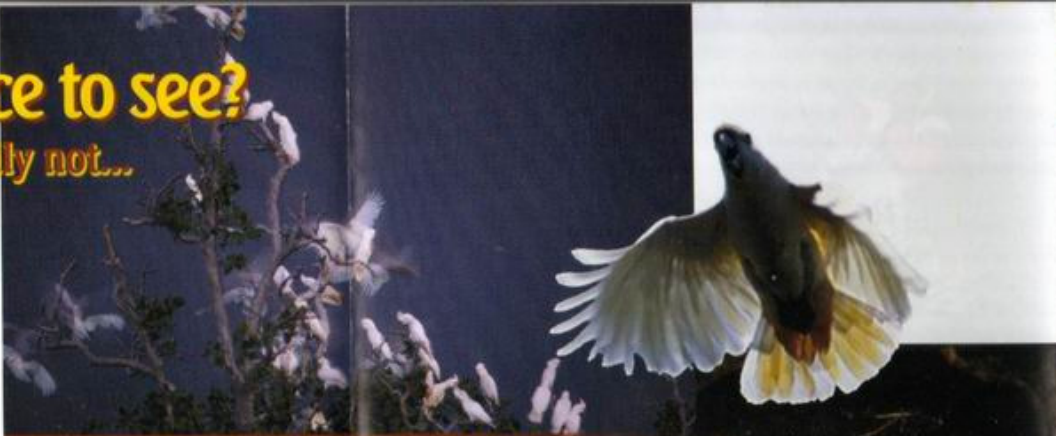
Traditional roosting site of Philippine Cockatoos

Y ou have the chance to encounter one of the most endangered animal species (and many others) in the wild: The Red-vented or Philippine cockatoo Cacatua haematuropygia . This parrot species is endemic to the Philippines. Formerly, it was widespread over most parts of the archipelago. Due to hunting, poaching and habitat destruction, it can now only be found in Palawan in viable numbers.