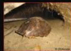
Hiding in den during day time