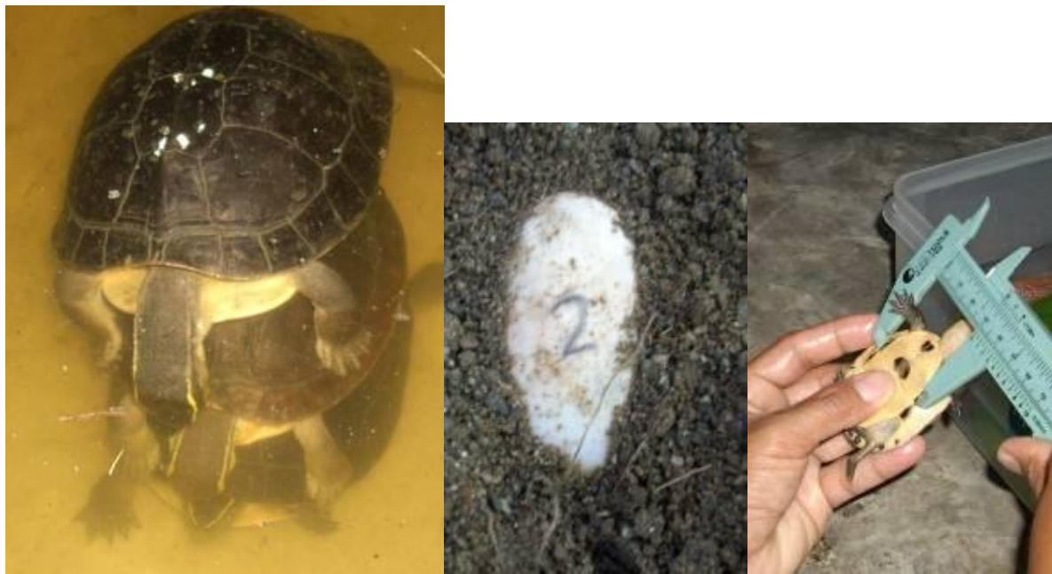
Figure 11: Cuora amboinensis : triple mating (left), egg (center), hatchling (right).