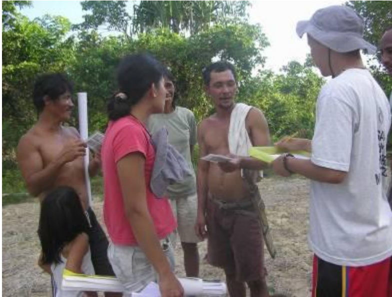
Figure 13: Interview with turtle hunter in central Palawan.