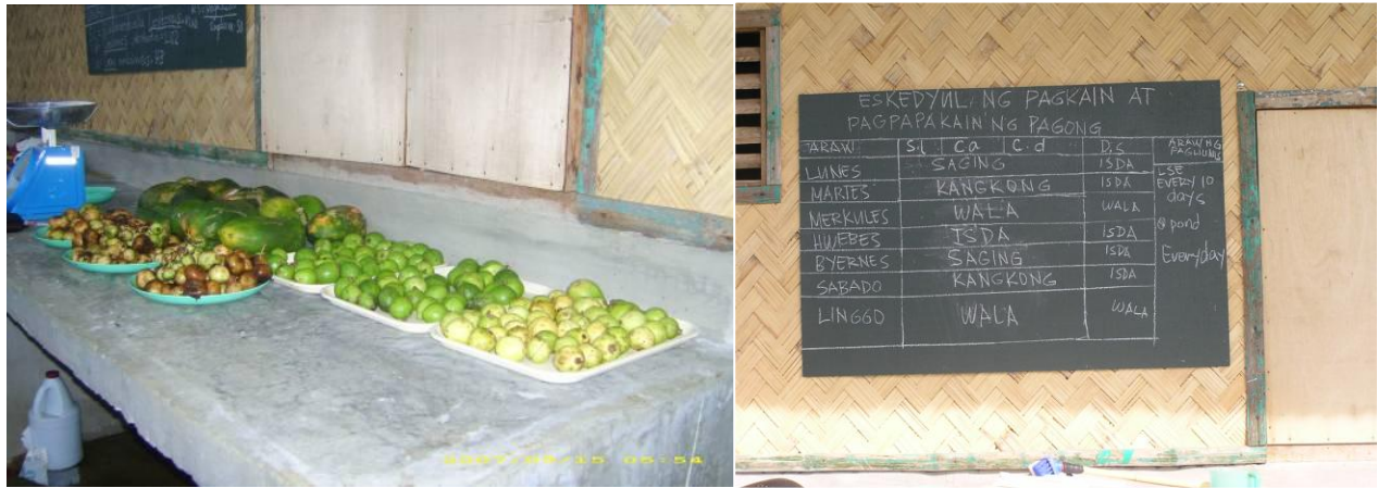
Figure 10: Food and feeding schedule. ©DAcosta.