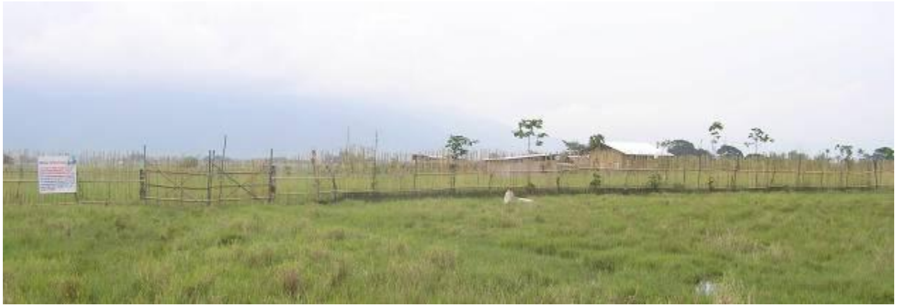
Figure 1: The entire 2ha of the future Katala Institute of Ecology and Biodiversity Conservation were fenced with boohoo.