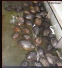
Specimens are collected to supply the demand for pet trade, food and traditional Chinese medicine