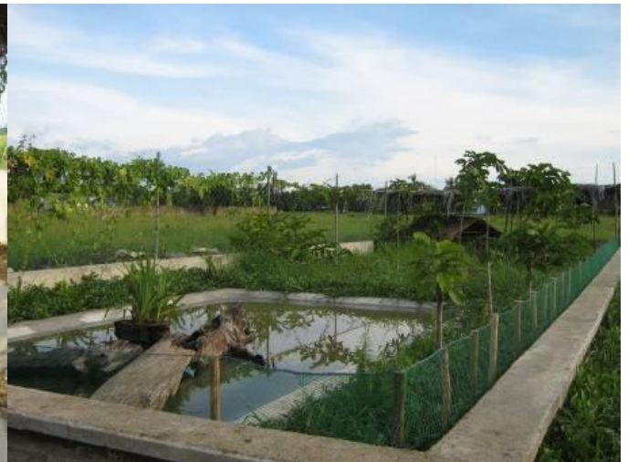
Figure 3: Outdoor enclosures at the start of the project.