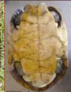
Dorsal view (carapace) and ventral view (plastron) of an adult S. leytensis .