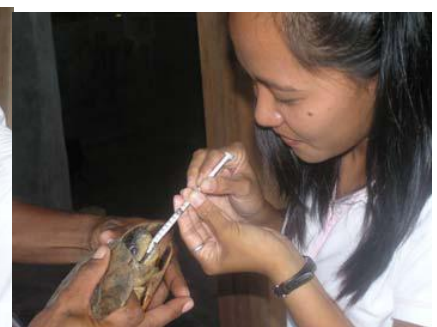
Figure 9: DENR-PENRO (left), DENR-CENRO (center) and KFI staff are applying dewormer to the newly acquired S. leytensis individuals.