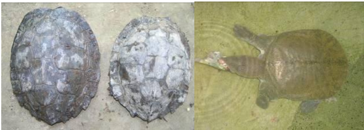
Figure 6: Cycllemys dentata (left) and the softshell turtle Dogania subplana (right).