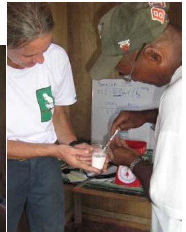
Figure 8: During turtle training: Calculation (left), weighing (center) and filling syringe with the amount of dewormer needed per kg body weight (right).