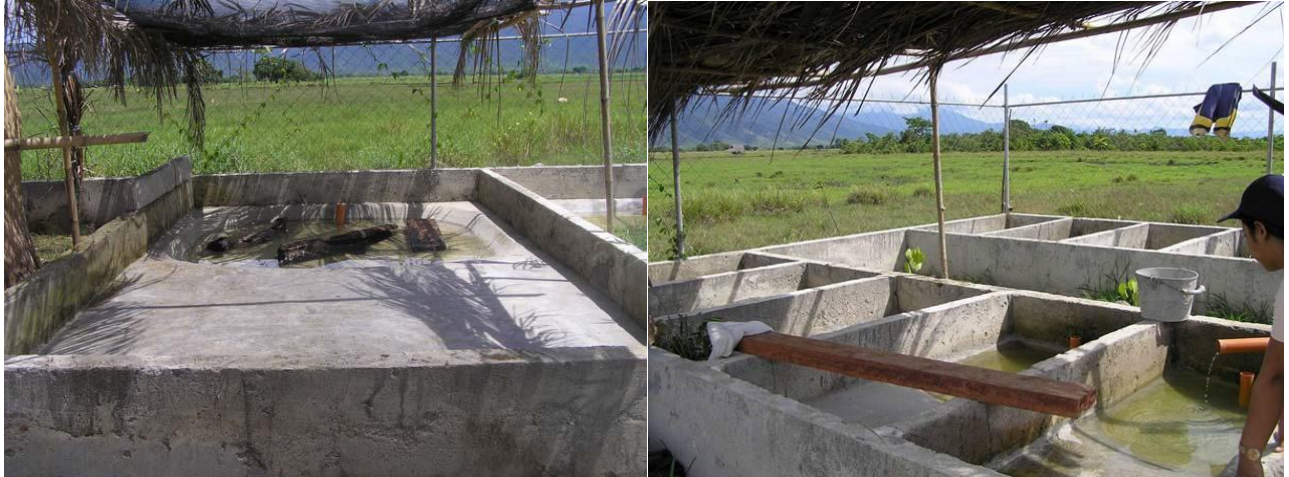
Figure 4: Large (left) and small (right) quarantine cells.