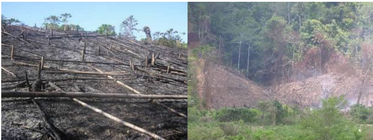
Figure 15: Fresh slash-and-burn area (left), and kaingin few days after burning (right).