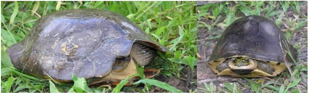
Figure 5: Siebenrockiella leytensis (left) and Cuora amboinensis (right).