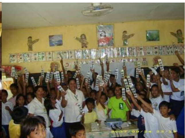
Figure 18: IEC at Tagabenit (left) and Taritien Elementary School (right).