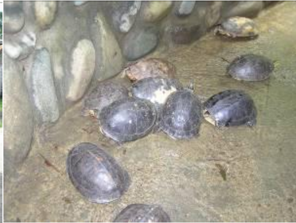
Figure 16: Police officer informing the owner of a store about the need to register wildlife by Dec. 1, 2007 (left). Freshwater turtles incl. the Palawan endemic S. leytensis encountered in a restaurant in Puerto Princesa City during the house-to-house IEC.