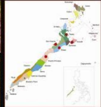
S. leytensis distribution map