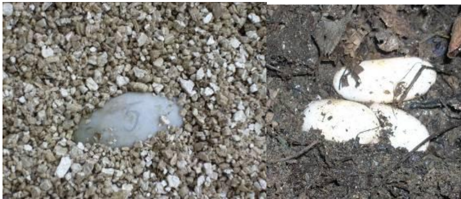
Figure 12: Siebenrockiella leytensis egg (left) and C. dentata egg clutch (right).