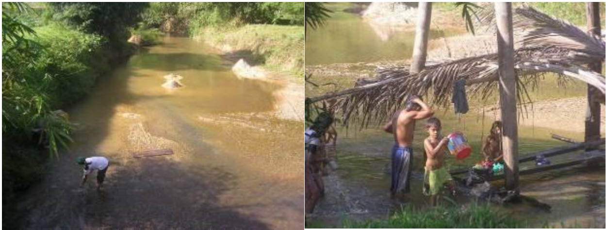
Figure 14: Threats: Sand mining (left), bathing area for people (right).