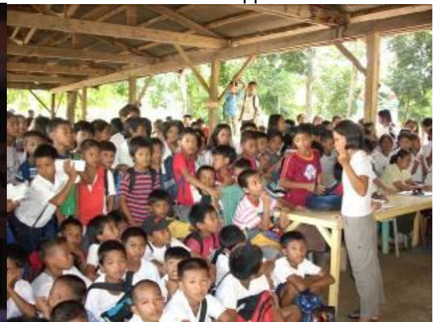
Figure 17: CITES and Wildlife Act Enforcement Training Workshop (left). IEC at Princes Urduja Elementary School (right).