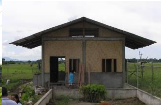
Figure 2: Signboard informing about project and ECC clearance at the entrance the National highway (left). Turtle care taker house (right).