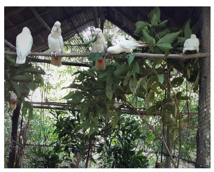
The cockatoos perched in the pre-release aviary with branches of native trees as perch.