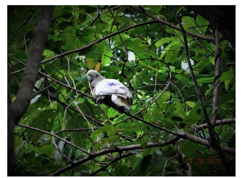
A released bird with its wing markings surveyed its surroundings in Dumaran Island Critical Habitat, Palawan.