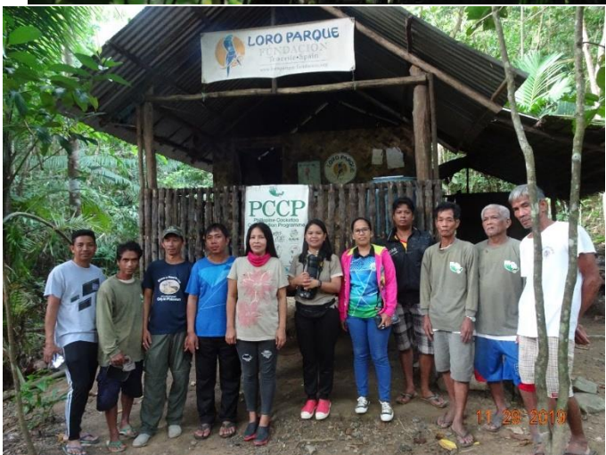
Katala staff with team from CENRO-Roxas and LGU-Dumaran