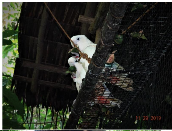
Two of the five released birds stayed at a feeding platform to enjoy some Pagatpat fruits. The other three flew into the forest of Dumaran. Note the leg bands of the released cockatoos.